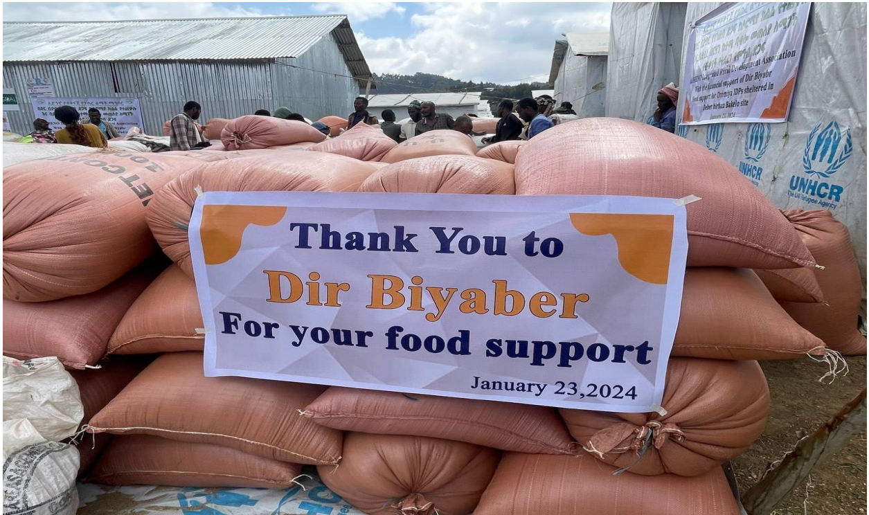
Figure 4: Food items delivered to IDPs