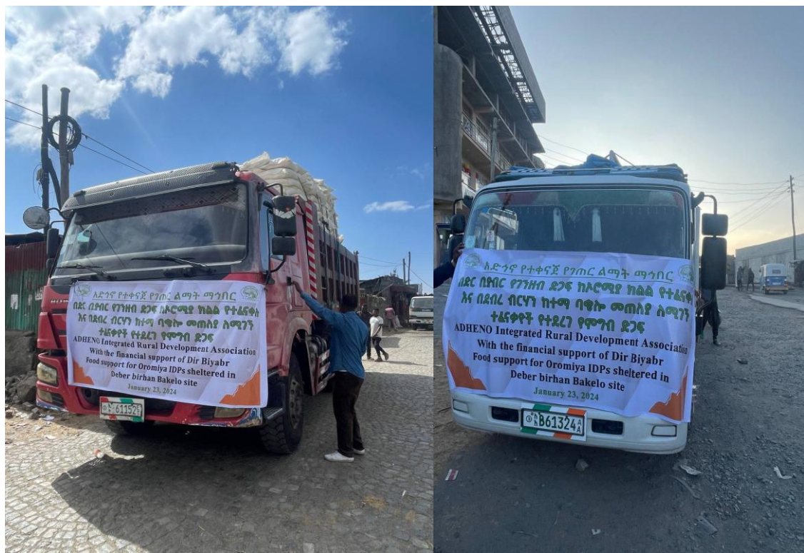
Figure 3: While transporting the food items