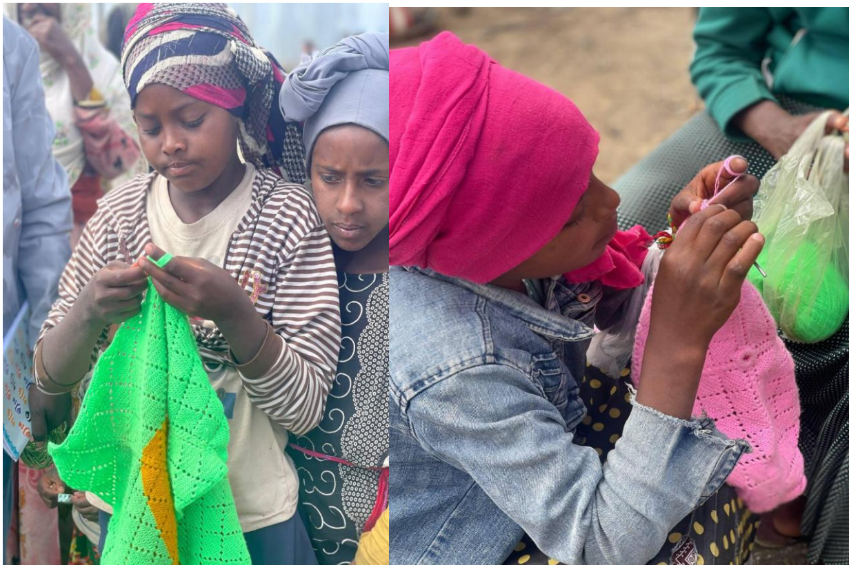
Figure 5: Children engaging in crochet work

In this regard, phase2 of this project is aimed at addressing the above needs of artisans who are engaging themselves in weaving, baskets, and embroidery & crochet activities. The total budget allocated for this phase is 1,398,000 ETB. Additionally, ADHENO will deliver books and stationery materials to children who have been denied access to education.